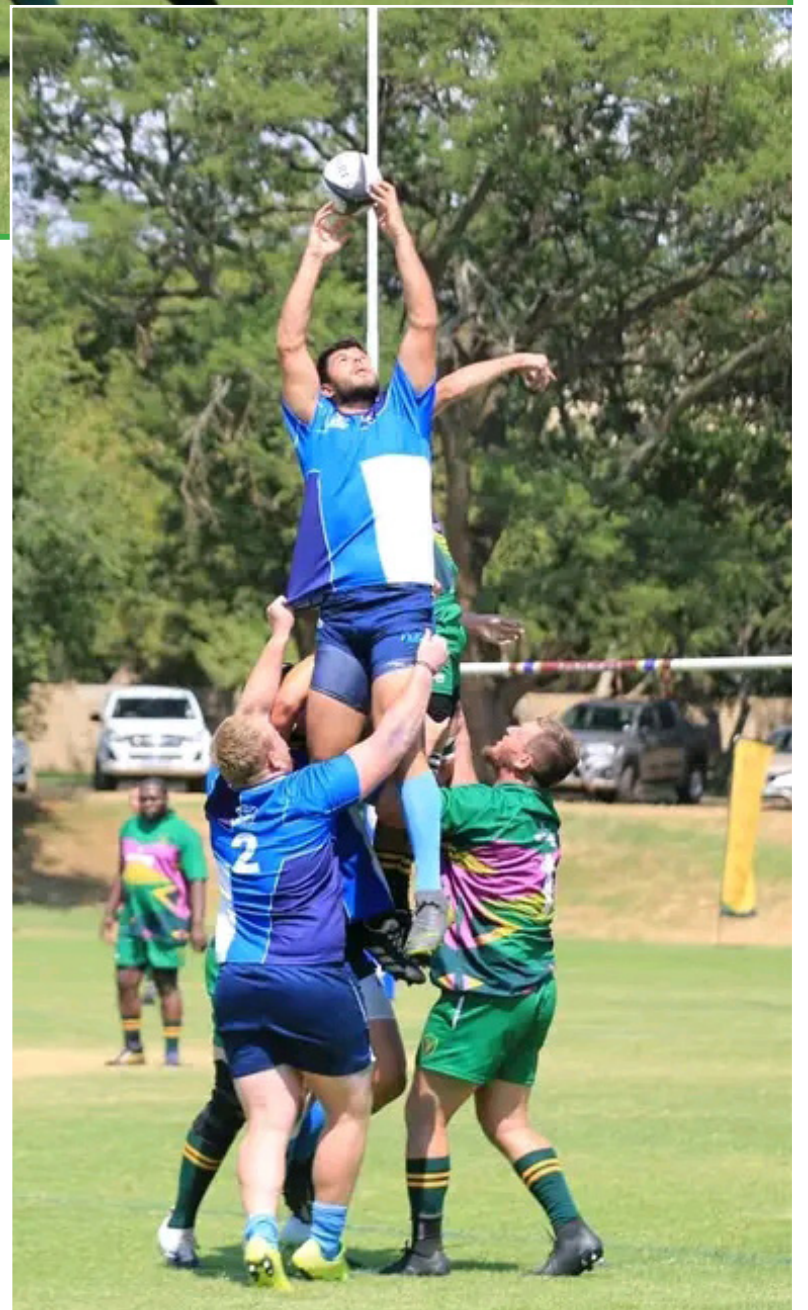
The highly anticipated Mapungubwe Rugby Cup will be taking place at the Old Peter Mokaba Stadium on Friday 27 March 2026.