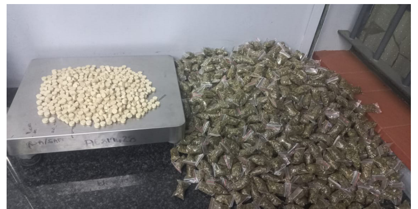
Some of the confiscated drugs have an estimated street value of R110,760 which were seized by the police in Sekhukhune and Capricorn Districts.