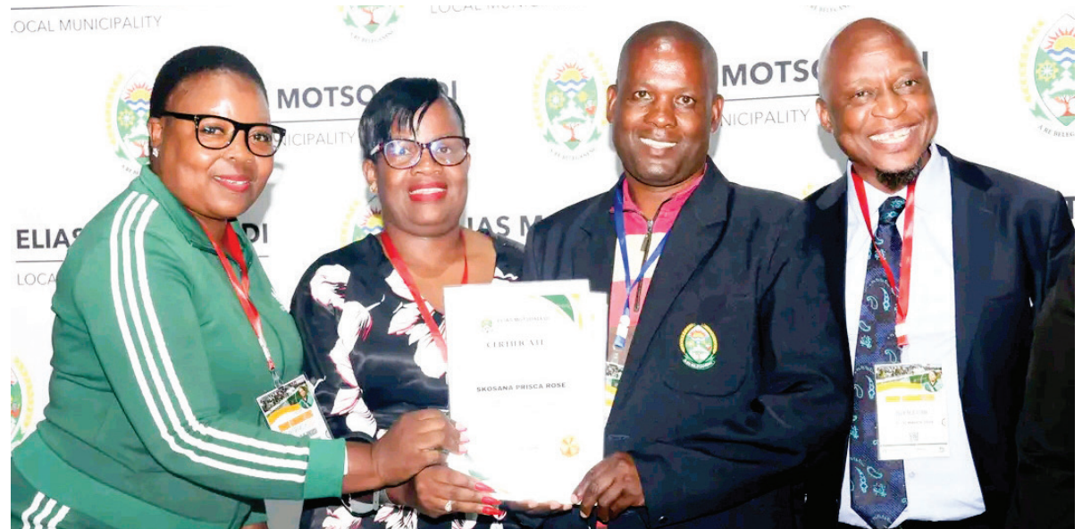
Certificates and awards were presented to the best-performing wards during the EMLM Ward Committee Conference.

Participants were encouraged to return to their wards with renewed energy, focusing on addressing