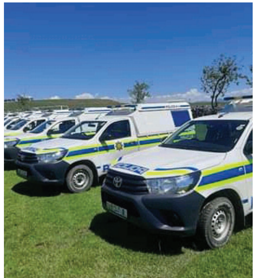
The police in various police stations around Sekhukhune have activated a massive manhunt for suspects involved in murders of two people at taverns around the district.

Ledwaba said the police appeal to the public for assistance in tracking down the suspect and those with information may contact investigating officer, Sergeant Mpho Mogale on 076 814 6522, their nearest police station, call the Crime Stop number on 08600 10111 or make use of MySAPS App.