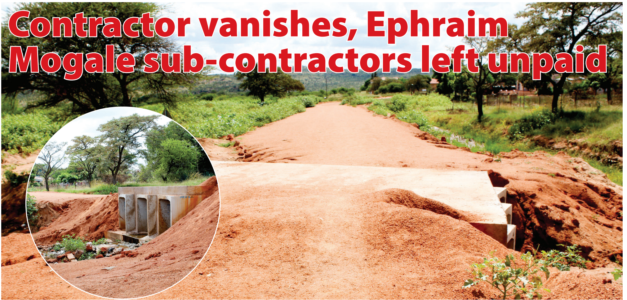
The alleged abandoned D4340 Road Project has created a hazardous environment in the Tsimanyane area.