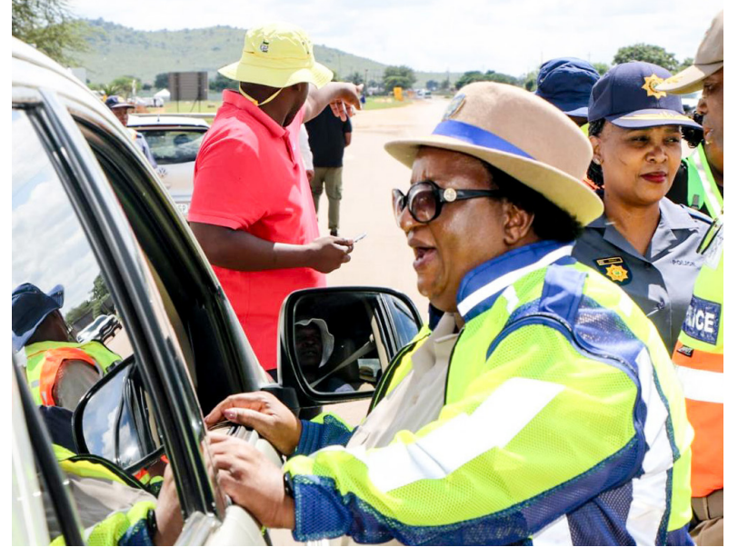
MEC for Transport and Public Safety in Limpopo, Violet Mathye, leading the road safety operation during the launching of the Limpopo Provincial 2026 Easter Road Safety Campaign.

LIMPOPO - As the Easter holiday approaches, the Limpopo Department of Transport and Community Safety has launched the provincial 2026 Easter Road Safety Campaign, urging all road users to take personal responsibility for safety on the roads.