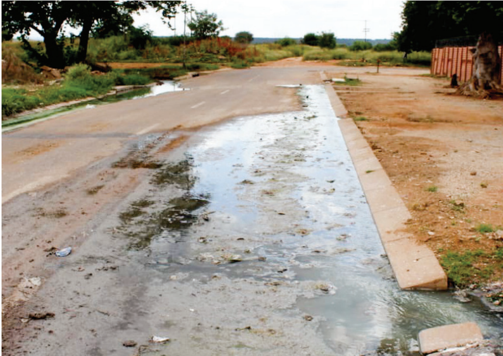
The unattended sewage spillage, which has been experienced for the past seven years, is posing risk to people around Marble Hall.

MARBLE HALL – The Democratic Alliance (DA) in Ephraim Mogale Local Municipality (EPMLM) has called on EPMLM Mayor, Cllr Given Moimane, to intervene in a seven-year-long unattended sewage crisis at Ficus Street in Marble Hall Town.