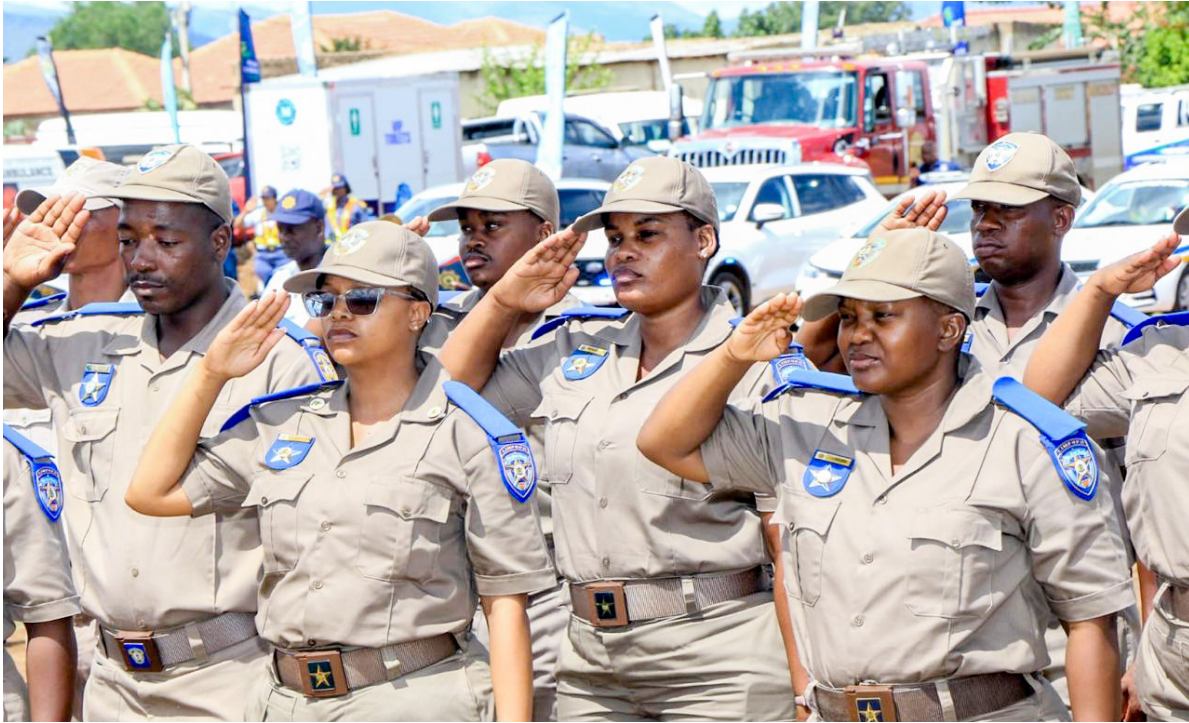
Limpopo law enforcements have vowed to 'take zero tolerance' during the 2026 Easter long-weekend.