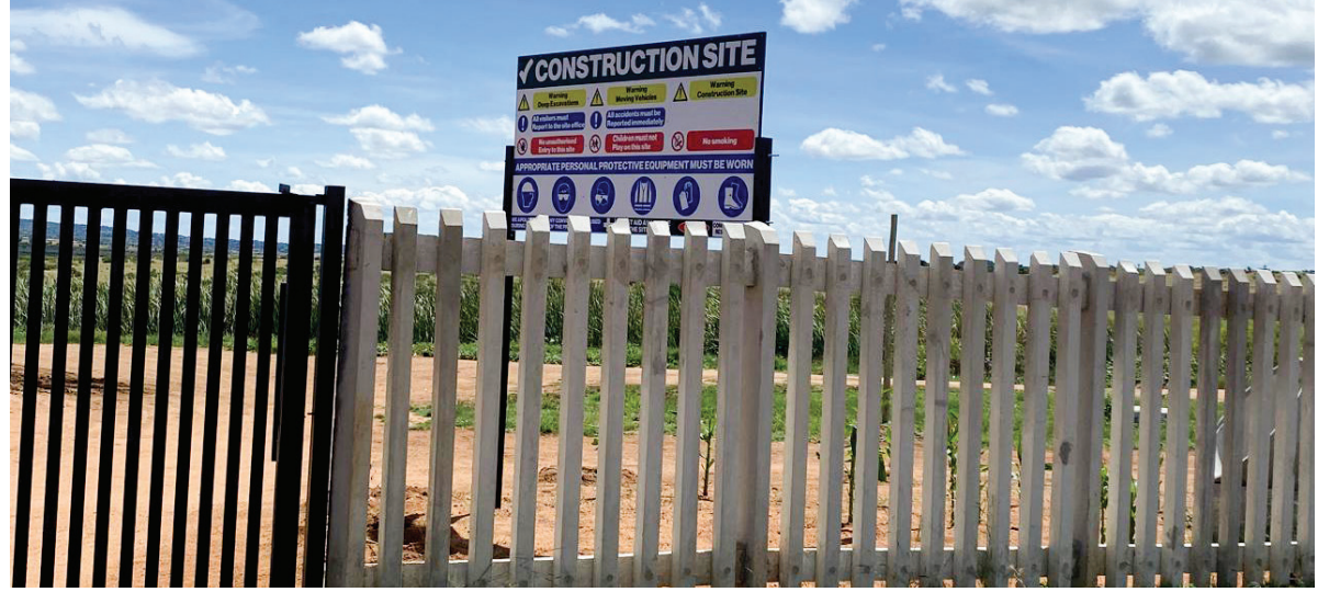
Sewerage truck owners who are dumping septic waste at Moripane Waste Plant are concerned about the new pricing system implemented by Sekhukhune District Municipality.

"We are not just business owners, we are community members who are not just concerned about their own