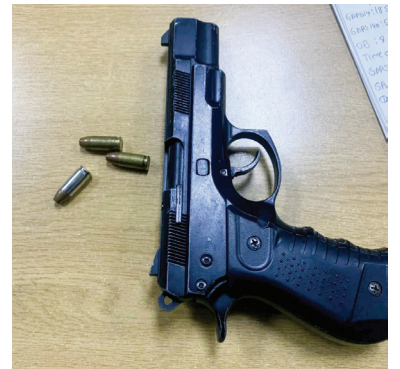
Unlicensed firearms were seized by the police during the operations.

hand goods dealers were inspected, 194 scrap yards searched, and 6,906 informal businesses inspected. A total of 15,716 persons were searched, 10,490 vehicles searched, and 4,554 stop-and-search operations conducted," he said.