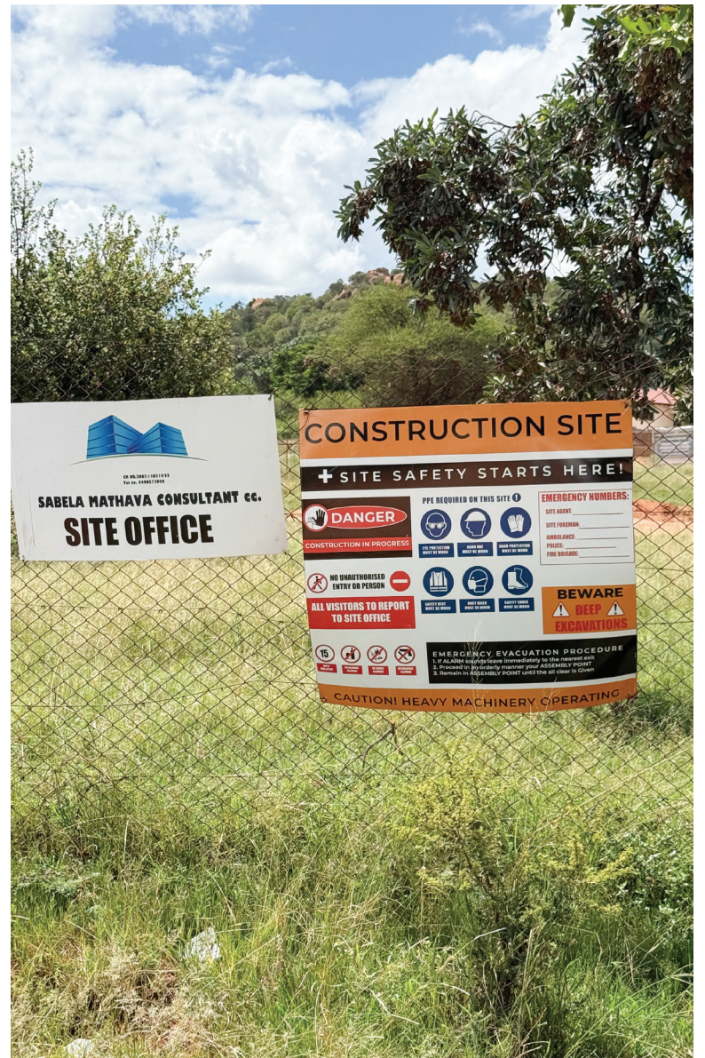
Concerned sub-contractors say they are worried that now the main contractor is removing equipment piece by piece showing signs that he will never return.

At the time of going to press, the Limpopo Department of Public Works could not respond to the publication's enquiries.